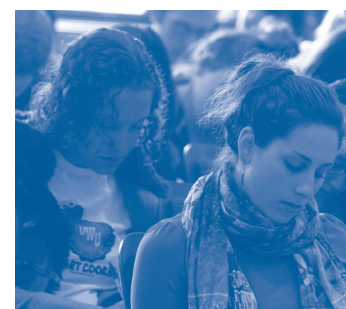
Cross-registration flows across Broadway in both directions, allowing Barnard and Columbia students to take classes on either campus.